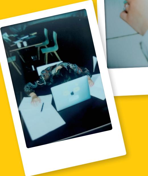
Pic. 5: "I don't like the distance learning! Here's a picture of me, there's a bunch of papers, a laptop, and there's just a huge workload in the 11th grade. You just lie there and die." (SH, 17, boy from Ukraine).